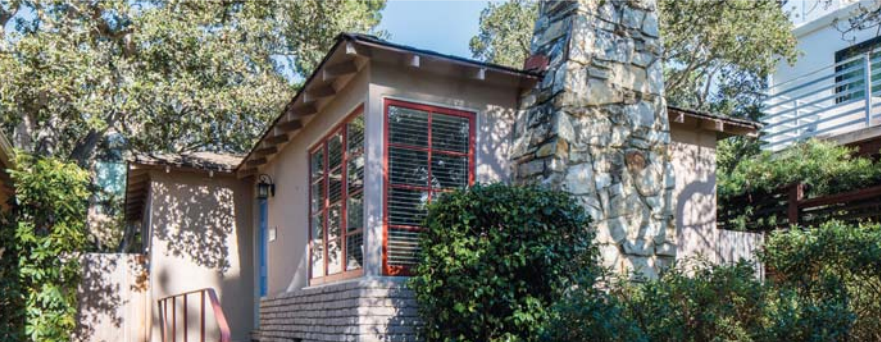
$1,550,000 • Each Cottage is 1 Bed, 1 Bath • Carmel2for1.com

Both come fully furnished with everything • Seller rented these out by the month for several years • Only about 3 blocks to downtown